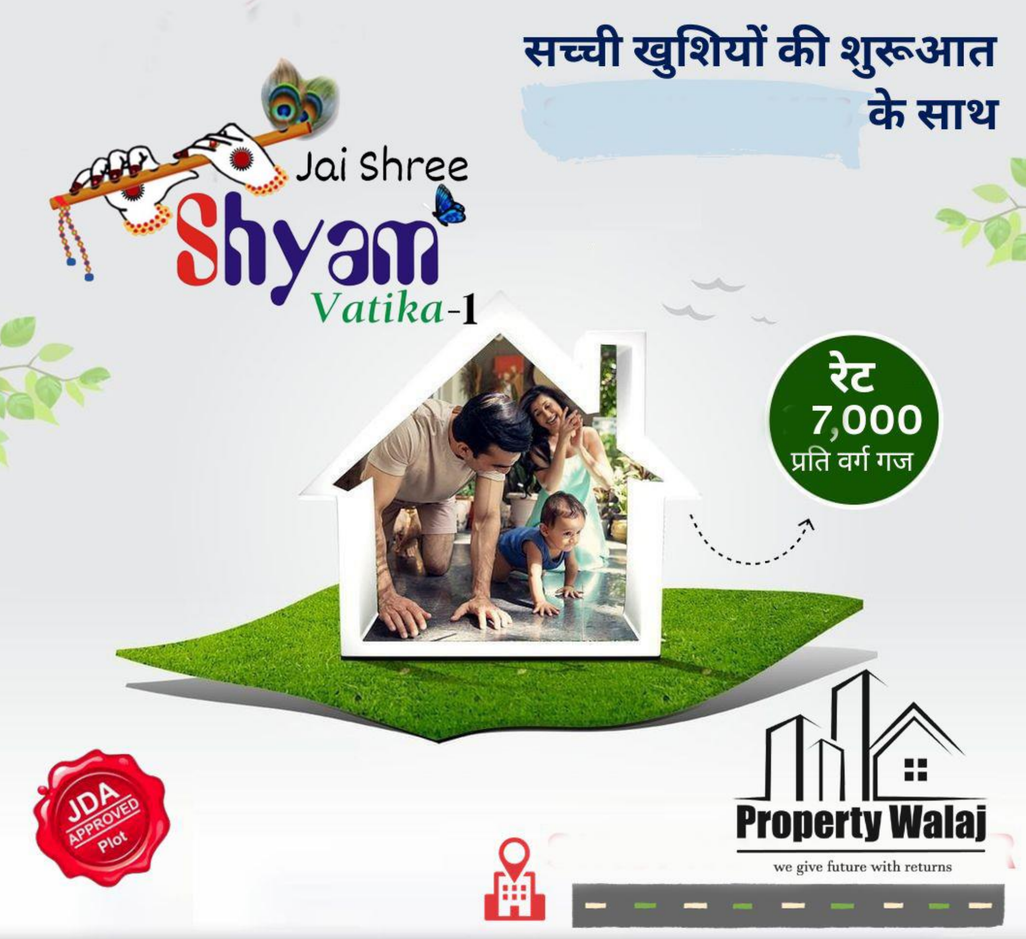
Get Plot on Pre Launching Rates now as Rates is increasing very soon